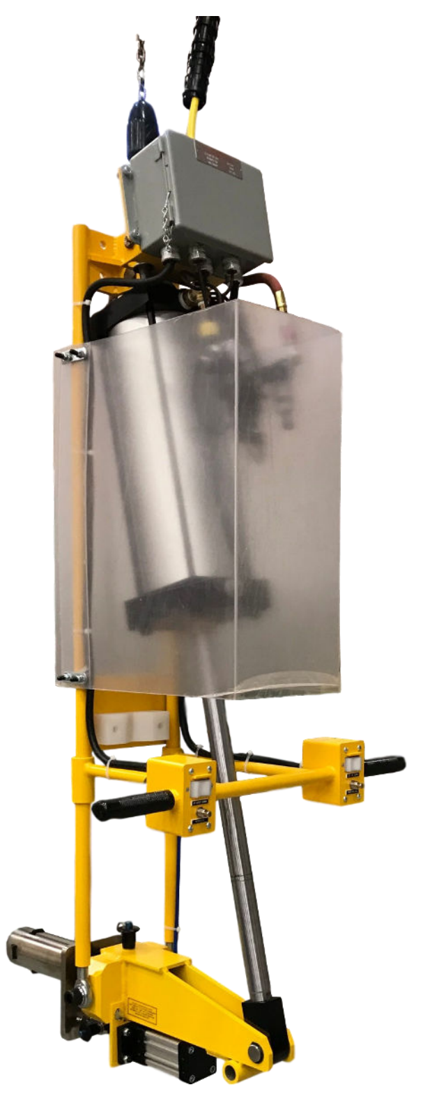
*Unit shown with pneumatic tooth release